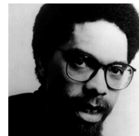
Cornel West, Ph.D. Keynote Speaker

Tuesday, February 27 through Thursday, March 1