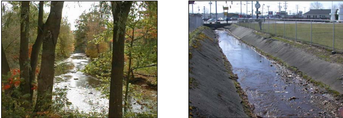
Figure 2: Natural Stream versus an Urbanized Stream

Land Use and Stream Form: Impacts associated with development go beyond flooding. The greater volume and intensity of runoff leads to increased erosion from construction sites, downstream areas, and stream banks. Because a stream's shape evolves over time in response to the water and sediment loads that it receives, development-generated runoff and sediment cause significant changes in stream form. To facilitate increased flow, streams in urbanized areas tend to become deeper and straighter than vegetated streams, and as they become clogged with eroded sediment, the ecologically important pool and riffle pattern of the stream bed is usually destroyed (Figure 2).