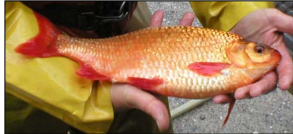
Figure 1. Rudd caught in Presque Isle Bay

Background The rudd ( Scardinius erythrophthalmus ) belongs to the large cyprinidae family, which includes carp and minnows (Figure 1). Native to Eurasia, rudd range from Western Europe to the Caspian Sea and Aral Sea Basins, and were introduced to the United States in the late 19 th century. The rudd is a somewhat stocky, deep-bodied fish with a forked tail, and the mouth is distinct with a steeply angled protruding lower lip. The scales are robustly marked, the back is dark greenish-brown, and the sides are brassy yellow tapering to a whitish belly. The pectoral, pelvic, and anal fins are bright reddish-orange, and the dorsal and tail fins are reddish-brown. Another identifying feature of the rudd is that the beginning of its dorsal fin is set well behind the front of the pelvic fins. The rudd can grow up to 19 inches in length. Young rudd consume macroinvertebrates, zooplankton, and occasionally small fish, while mature rudd feed mainly on submerged aquatic plant material and are inefficient processors of the available food supply. They inhabit weedy shoreline areas of lakes and rivers, and can adapt to a wide range of environmental conditions, including poor water quality.