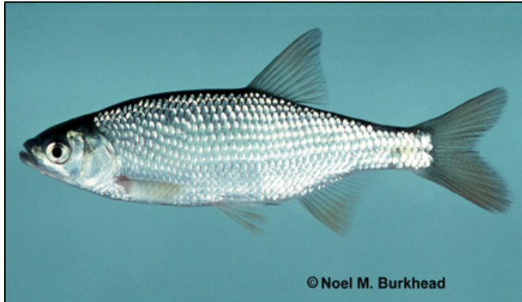
Figure 3. Rudd X Golden Shiner hybrid: Image from the USGS Nonindigenous Aquatic Species Web site: http://nas.er.usgs.gov/queries/SpFactSheet.asp?speciesID=648

Impact The impact of the rudd's introduction is relatively unknown. Laboratory studies have confirmed that rudd hybridize with the golden shiner, a primary forage species of many game fish, and the probability exists that rudd introduced to open waters will hybridize with golden shiners, with unknown consequences to wild populations of native species (Figure 3). Aside from hybridization, the rudd can be expected to compete with native fish for food. Also, being omnivorous, the rudd can change its diet from insects and minnow to plants, unlike most native fishes. Rudd could affect the inland waters it inhabits by: 1) increasing the nutrient loading due to its inefficient means of processing plant material; 2) depleting aquatic vegetation and potentially reducing the reproductive success of native fish species using near-shore areas for spawning and nursery sites; 3) competing with native fish species for food and habitat in juvenile stages; and 4) disrupting established predator/prey relationships.